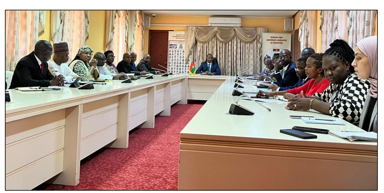
Figure 2: PSC Members engaging with the speaker of the National Assembly