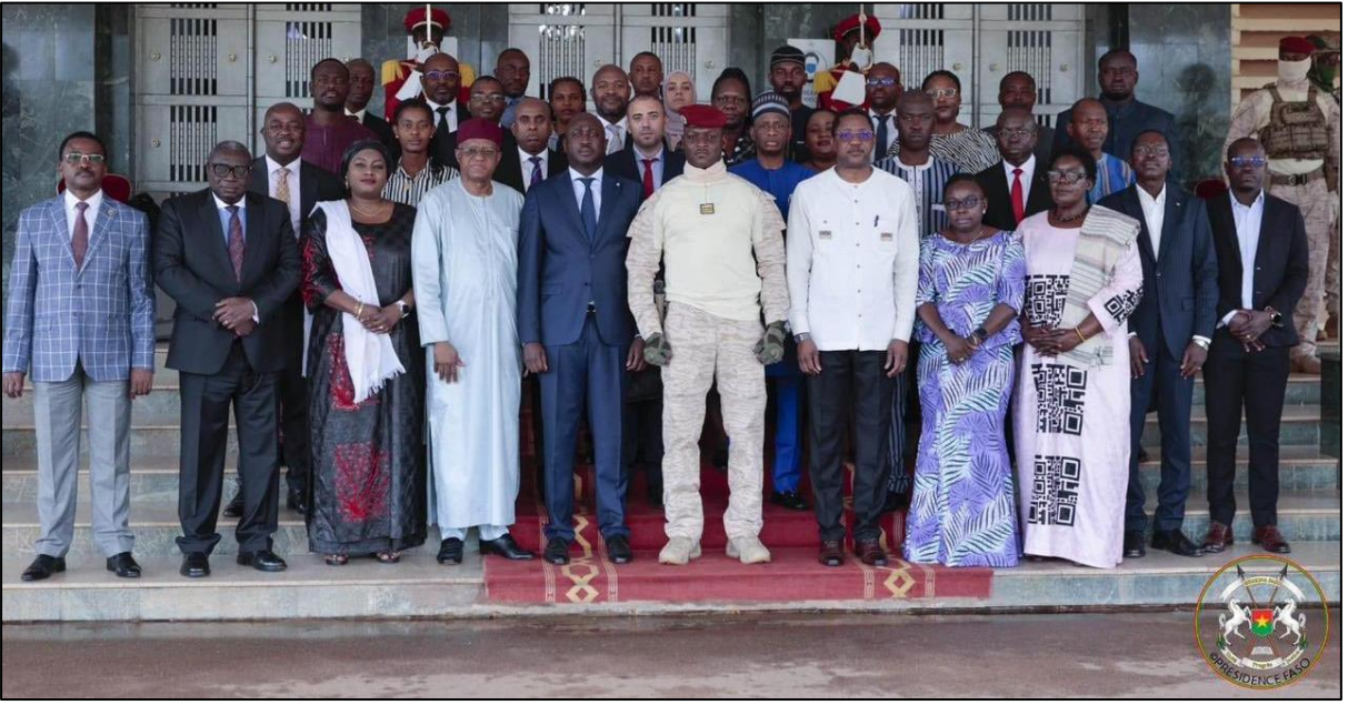
Figure 1: The AU PSC paid a courtesy call to the President of the Transition, Captain Traore.

11. The Speaker explained that the Transition Charter had a timeline on which the 24 July 2024 deadline was collectively agreed upon with ECOWAS as the deadline for the elections and as per the reporting, the timeline remains valid. He however stressed that it was needful to examine the fundamental issues in the country, especially the security context, in light of the transition roadmap. He highlighted that if the key challenges and threats facing the country were addressed before the agreed deadlines, the transition government would call for elections before 2024. Furthermore, regarding the transitional agenda, the Speaker underscored that the Transition Authority had engaged in consultations with key stakeholders across the country, including traditional and religious leaders, and women groups among others, to sample their perspectives on key reforms such as the constitution, electoral code, the transition charter among others and that the report is being prepared and findings will be shared.