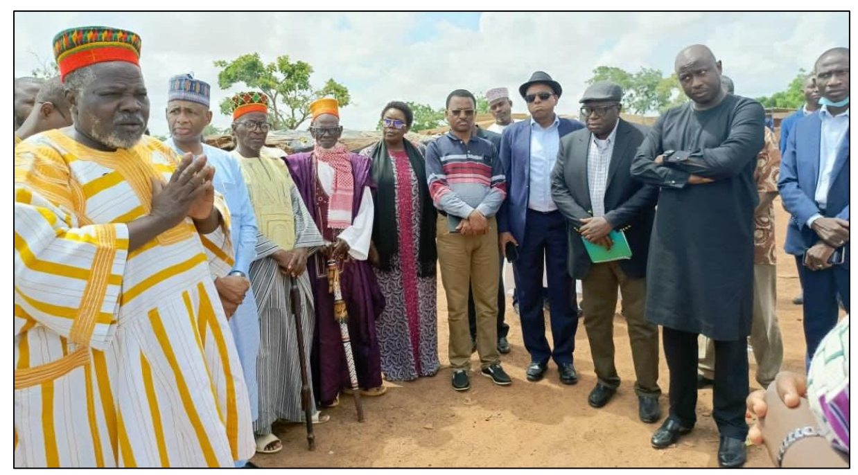
Figure 3: The PSC Delegation equally visited an IDP Camp, in Nagréongo, within the Plateau-Central region, situated about 30km from the capital, Ouagadougou.