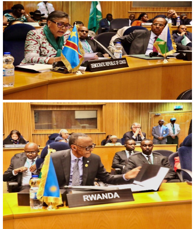
Figure 2: Speakers at the 1261st Session of the PSC

The meeting was not initially included in the Provisional Programme of Work. It is prompted by rapidly unfolding developments that necessitated urgent attention beyond the originally planned agenda. It is recalled that the urgency of the situation was highlighted by the 1256 th Emergency Ministerial Meeting, held on 28 January 2025 which expressed deep concern over the activities of M23 and proposed a high-level summit on the margins of the AU Assembly in February 2025. The fall of Goma and subsequent M23 advances into South Kivu, coupled with the inability of regional forces such as the Southern African Development Community (SADC) Mission in the DRC (SAMIDRC) and the United Nations Organization Stabilization Mission in the DRC (MONUSCO) to halt the offensive,