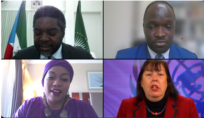
Figure 3: 1262nd Session of the PSC (Source X: @AUC_PAPS)

programmes, to restore the dignity and rights of children recruited and exploited in armed conflicts.’