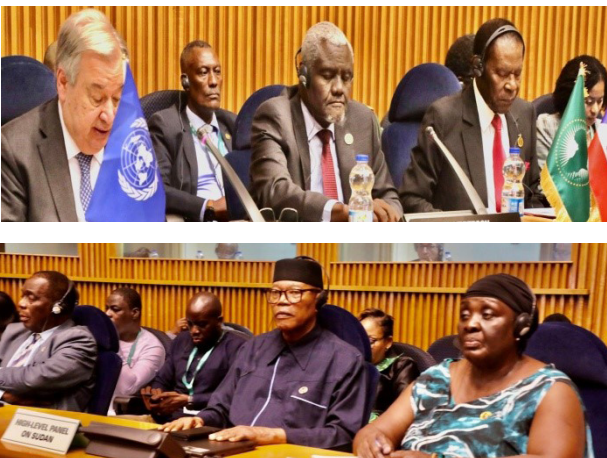
Figure 1: The PSC's 1261st session on the situation on Sudan, 14 February 2025

On 14 February, the PSC convened its 1261 st session at the level of Heads of State and Government on the margins of the 38 th AU Summit to consider the situation in Sudan. 3